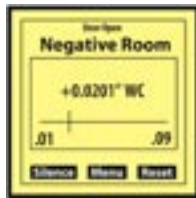
If pressure is Normal and Door is open, the screen is Yellow.