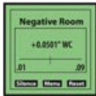
If pressure is Normal, the screen is Green.

The touch sensitive screen allows easy navigation of the menu tree to configure the SRPM for negative or positive room pressure control.