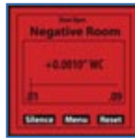
If pressure falls outside of preset limits (Alarmed State), the screen is Red.